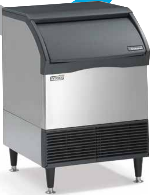
CU1526 / CU2026